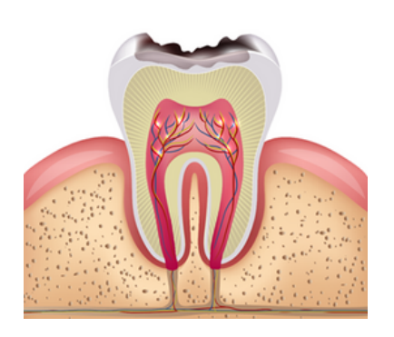
PLAQUE + SUGAR = DECAY

When sugar is eaten it causes the environment of the mouth to become acidic.